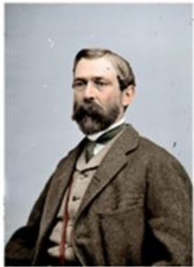
GENERAL RICHARD SCOTT TAYLOR, CSA